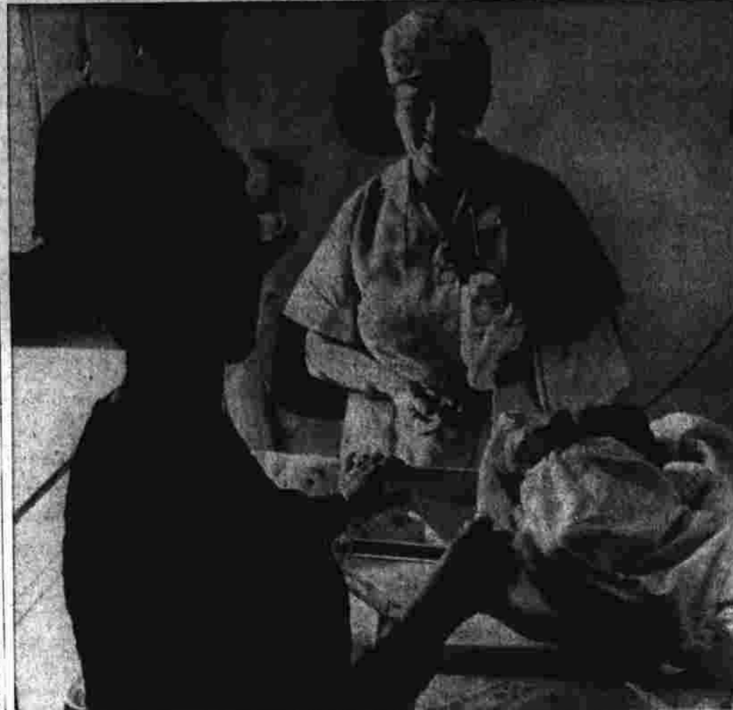
Your United Fund Gift Helps MPHNA